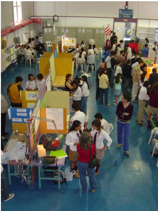
Figure 4: Participants preparing their displays at the Auger Science Fair, November 2005.

The projects were judged to be quite sophisticated, and the top projects were awarded prizes. During the Science Fair, participants were treated to presentations about the Observatory given in the Visitor Center. The collaboration is indebted to the Observatory staff, the local organizing team of 4 science teachers, and the city of Malargüe for helping to make the Science Fair a success. A second Auger-sponsored Science Fair is planned for November 2007.