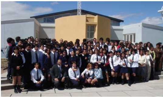
Figure 6: (Top) The front of the James Cronin School. (Bottom) Students and teachers behind the school on inauguration day.

raising ceremony, followed by a number of speeches, including Cronin, Malargüe mayor Raúl Rodríguez, and Mendoza governor Julio Cobos. The event received wide press coverage. In the evening of the same day, the students and teachers from the school held a separate inaugural celebration that included student projects on display in the classrooms, plus dance and theatrical performances by the students.