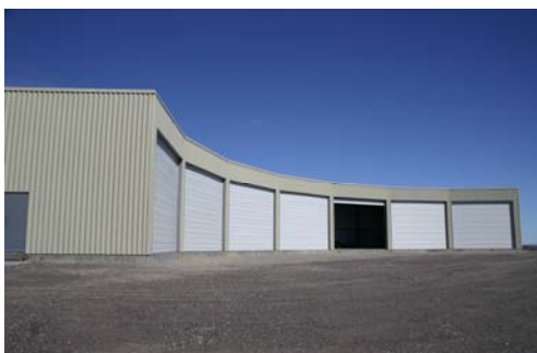
Figure 2: The Telescope Array Project: Middle Drum Observatory Building.

The northern-most fluorescence observatory has been constructed using refurbished equipment from the old HiRes-I observatory at Little Granite Mountain (aka Five Mile Hill). The equipment has been modified somewhat and has been relocated to a new building which itself provides some interesting new capabilities and possibilities.