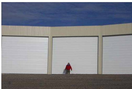
Figure 3: One of the PI's in front of a bay door to show scale

A picture of the Middle Drum Observatory is shown in Figure 2. The building, which houses 14 telescopes, consists of seven bays each about the size of a two car garage. As is readily apparent from the photo, this building is very different from either our Dugway/HiRes buildings, our original thoughts for the site (potentially putting each telescope in its own inclined conex box) or from the University of Tokyo designed buildings at Black Rock Mesa and Long Ridge. Several considerations were part of this decision. Among these were 1) putting everything in one building where the floor was flat made it much easier to