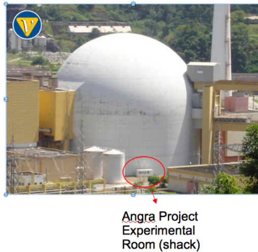
FIGURE 1. Photograph of the Angra II reactor and of the experimental shack (circled) presently being used by the Angra Collaboration for preliminary tests.