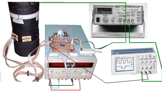
Figure 2: Laboratory test of the readout electronics for 16 channels.

As in the TUS receiver the photomultiplier tube (PMT) of Hamamatsu type R1463 was selected as an UV sensor. At the entrance window and UV filter are mounted. The filter cuts the light with wavelength >400 nm. Quantum efficiency of the cathode is 20% in the range of wavelength 300-400 nm. Signals from each 16 PM tubes are coming to the multiplexer and then to 10 bits ADC (Fig. 2). Four cards are controlling the 64 channels of the pixel camera (Fig. 3). The TUS mountain prototype electronics has been updated, for study of different types of UV events: EAS, TLE, meteors and sub-relativistic dust grains [2].